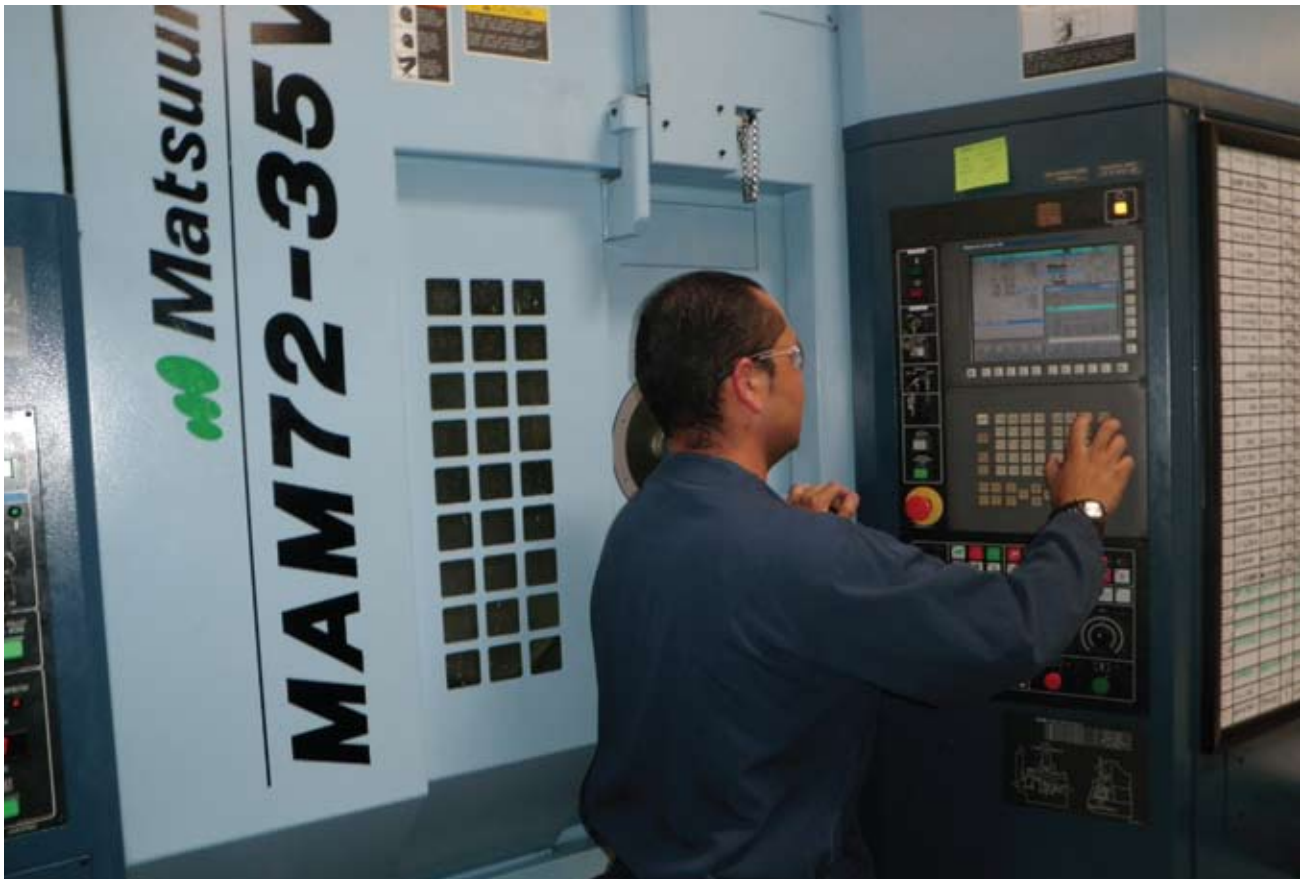
An engineer at True Position Technologies sets up an operation on a Matsuura VMC.

Multipallet machining reduces lead times, labor, and costs at CA aerospace shop.